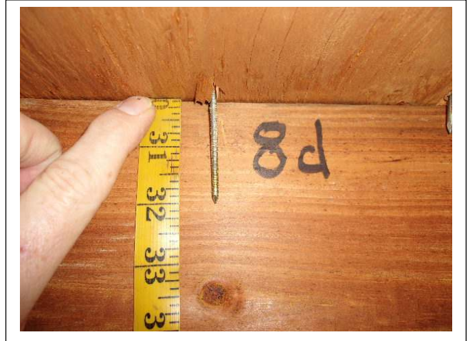
ROOF DECK ATTACHEMNT – 8d ring shank nails added in 2021