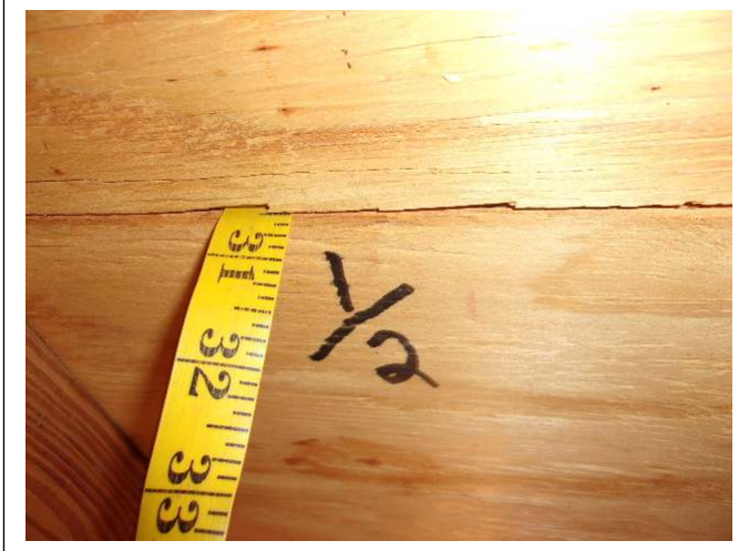
ROOF DECK THICKNESS – ½ inch plywood

R3 of Florida, LLC P.O. Box 152205 Cape Coral, FL 33915 Office: 239.810.7793 Email: radjrsas@yahoo.com