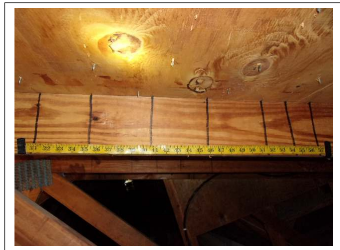
ROOF DECK ATTACHMENT – 8d nails within 6 inches in the field

Terrace VIII at Heritage Cove Condominium Association 14051 Brant Point Circle, Fort Myers, FL 33919 12-12-2022