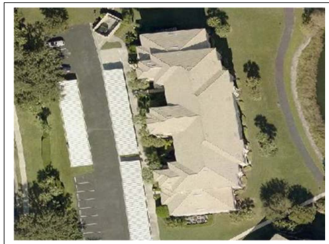
ROOF GEOMETRY – Aerial view of the hip roof shape