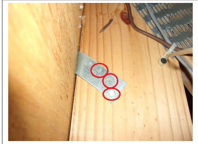
ROOF TO WALL ATTACHMENT – Properly installed Single Wraps