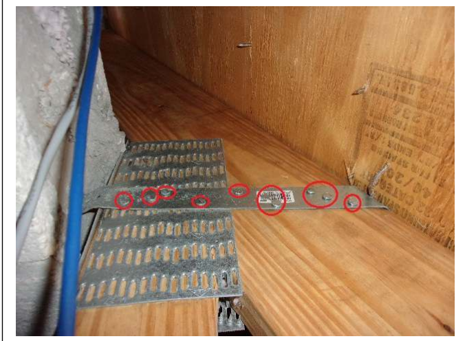
ROOF TO WALL ATTACHMENT – Properly installed Single Wraps

R3 of Florida, LLC P.O. Box 152205 Cape Coral, FL 33915 Office: 239.810.7793 Email: radjrsas@yahoo.com