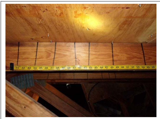
ROOF DECK ATTACHMENT – 8d nails within 6 inches along the edge