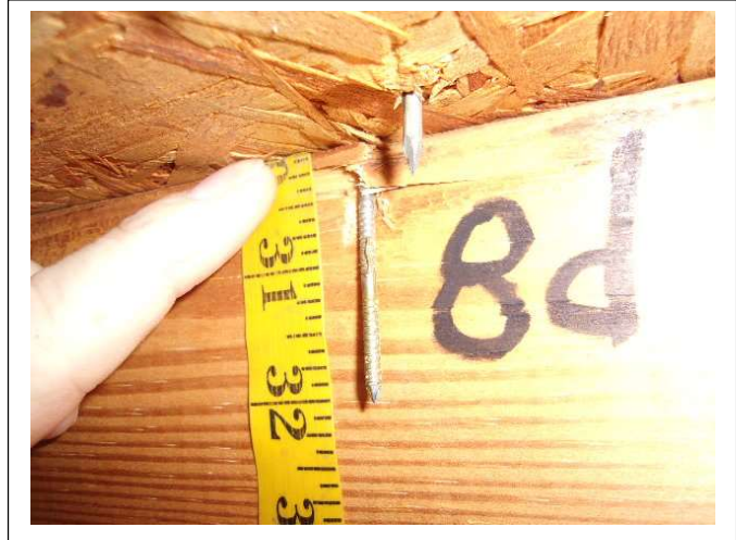
ROOF DECK ATTACHEMNT – 8d ring shank nails installed in 2018