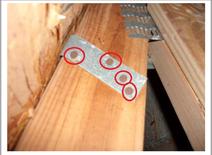
ROOF TO WALL ATTACHMENT – Properly installed Single Wraps