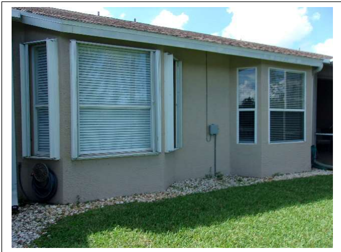
OPENING PROTECTION – Although some unit owners have installed wind-borne debris protection devices, others have not, leaving some openings (entry doors, window units and/or sliding doors) unprotected