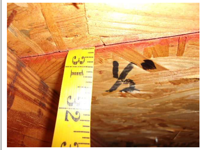
ROOF DECK THICKNESS – ½ inch OSB

R3 of Florida, LLC P.O. Box 152205 Cape Coral, FL 33915 Office: 239.810.7793 Email: radjrsas@yahoo.com