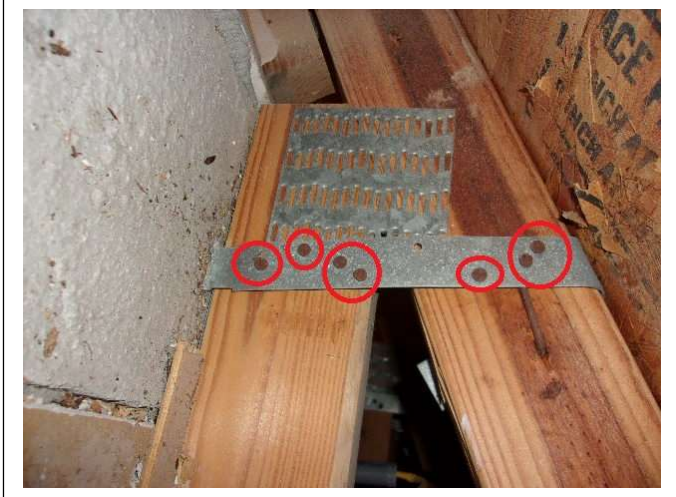
ROOF TO WALL ATTACHMENT – Properly installed Single Wraps

R3 of Florida, LLC P.O. Box 152205 Cape Coral, FL 33915 Office: 239.810.7793 Email: radjrsas@yahoo.com