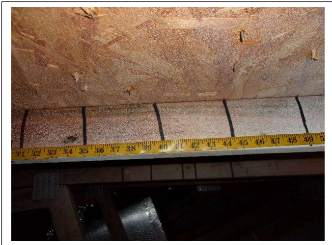
ROOF DECK ATTACHMENT – 8d nails within 6 inches along the edge