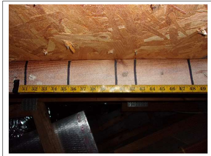
ROOF DECK ATTACHMENT – 8d nails within 6 inches in the field