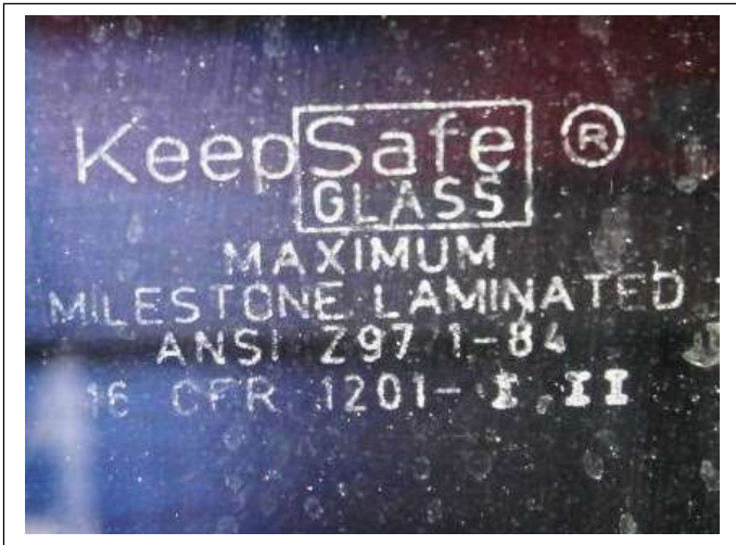
OPENING PROTECTION – The window units are large missile rated. FBC# FL239