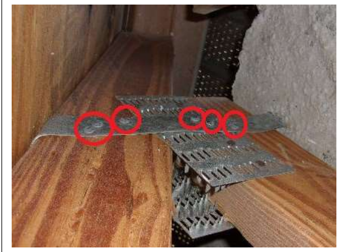
ROOF TO WALL ATTACHMENT – Properly installed Single Wraps

R3 of Florida, LLC P.O. Box 152205 Cape Coral, FL 33915 Office: 239.810.7793 Email: radjrsas@yahoo.com