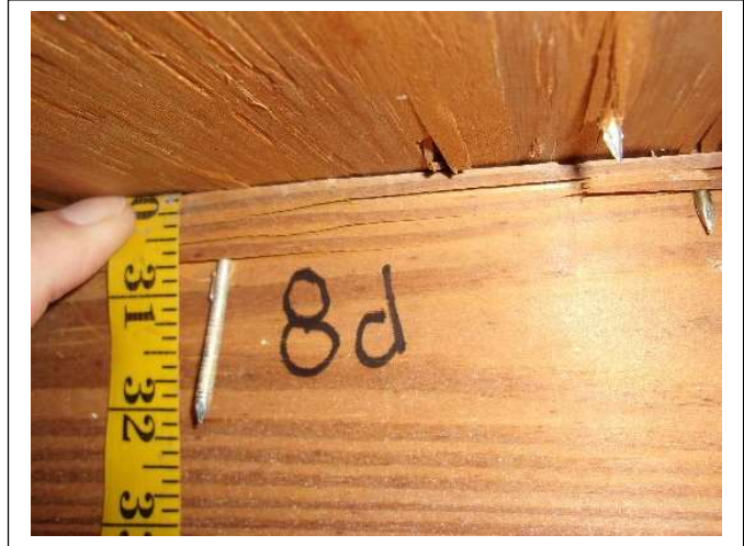
ROOF DECK ATTACHEMNT – 8d ring shank nails installed in 2018