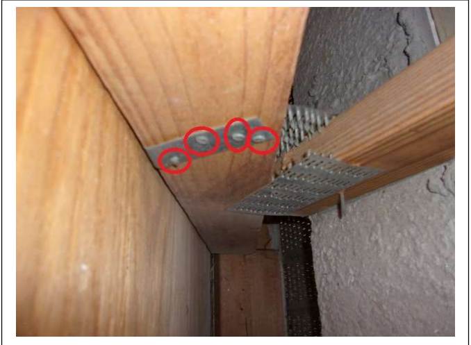
ROOF TO WALL ATTACHMENT – Properly installed Single Wraps