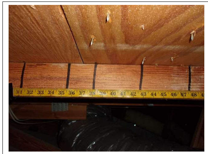
ROOF DECK ATTACHMENT – 8d nails within 6 inches in the field