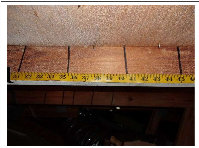
ROOF DECK ATTACHMENT – 8d nails within 6 inches along the edge