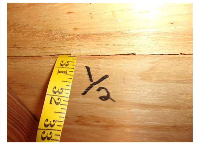
ROOF DECK THICKNESS – ½ inch plywood

R3 of Florida, LLC P.O. Box 152205 Cape Coral, FL 33915 Office: 239.810.7793 Email: radjrsas@yahoo.com