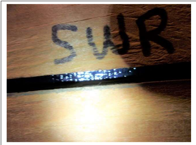
SECONDARY WATER BARRIER – A polymer adhesive (peel & stick) SWR Barrier was installed on the entire roof deck in 2018