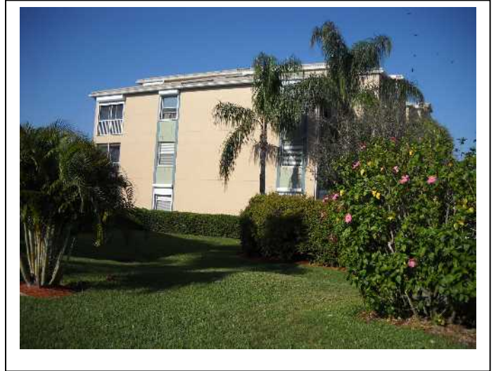
SIDE ELEVATION VIEW