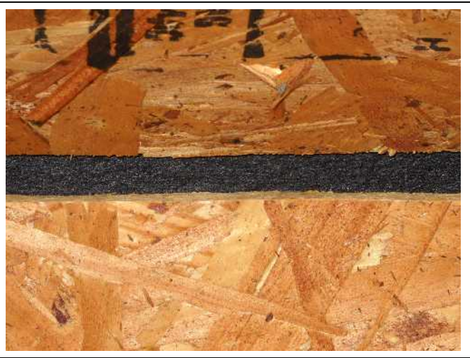
SECONDARY WATER BARRIER – Is not present.