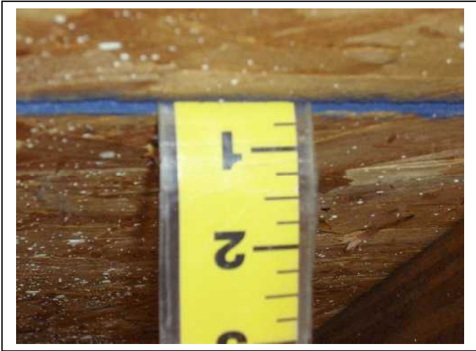
ROOF DECK THICKNESS

R3 Inspections, LLC P.O. Box 152205 Cape Coral, FL 33915 Office: 239.810.7793 Email: radjrsas@yahoo.com