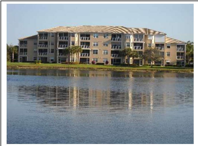
REAR ELEVATION VIEW