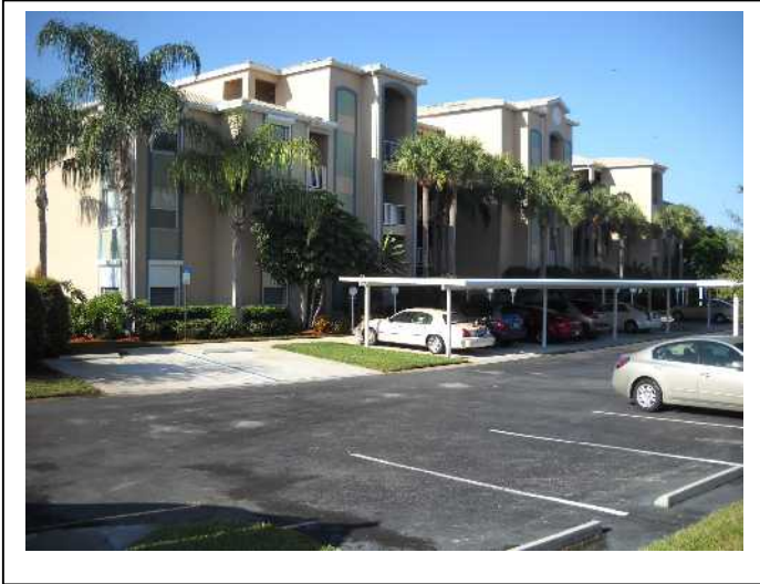
FRONT ELEVATION VIEW

R3 Inspections, LLC P.O. Box 152205 Cape Coral, FL 33915 Office: 239.810.7793 Email: radjrsas@yahoo.com