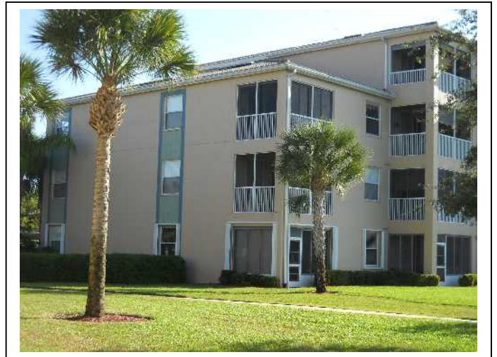
SIDE ELEVATION VIEW

Terrace VII at Heritage Cove Association 14061 Brant Point Circle, Fort Myers, FL 33919 01-12-2012