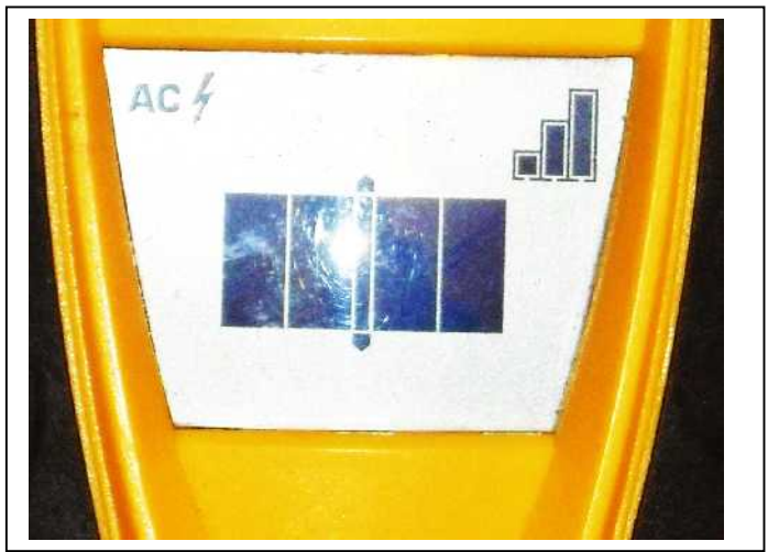
REINFORCED MASONRY IF APPLICABLE

Terrace VII at Heritage Cove Association 14061 Brant Point Circle, Fort Myers, FL 33919 01-12-2012