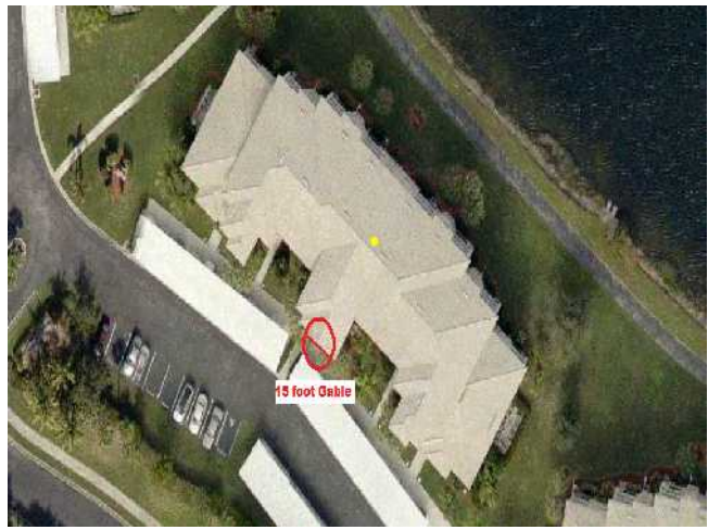
ROOF SHAPE – The length of the small gable measured 15 feet. The total roof perimeter measured 630 feet. 15 \text{ divided by } 630 = 2.38\% . Hip Roof Geometry