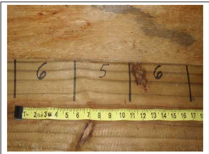
ROOF DECK ATTACHMENT – 8d@6"6"