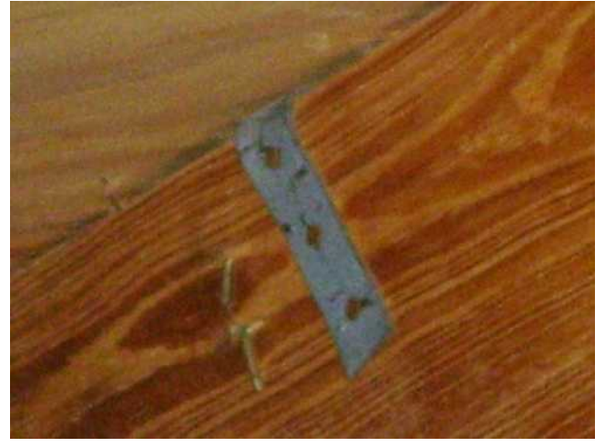
ROOF TO WALL ATTACHMENT – Properly installed Single Wraps