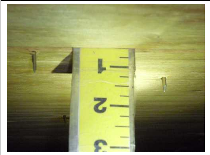
ROOF DECK THICKNESS – ½ inch plywood

R3 Inspections, LLC P.O. Box 152205 Cape Coral, FL 33915 Office: 239.810.7793 Email: radjrsas@yahoo.com