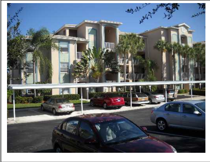
FRONT ELEVATION VIEW

R3 Inspections, LLC P.O. Box 152205 Cape Coral, FL 33915 Office: 239.810.7793 Email: radjrsas@yahoo.com