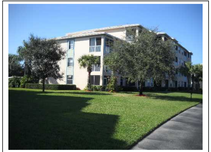
SIDE ELEVATION VIEW

Terrace II at Heritage Cove Association 14111 Brant Point Circle, Fort Myers, FL 33919 01-12-2012