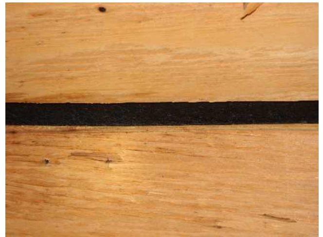
SECONDARY WATER BARRIER – Is not installed.