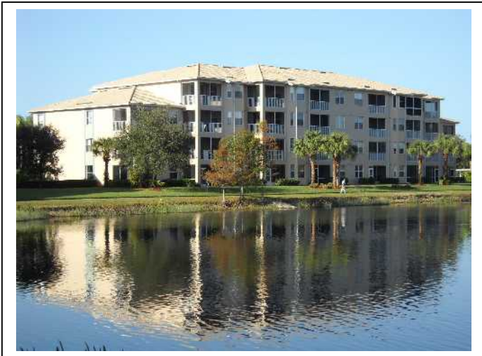
REAR ELEVATION VIEW