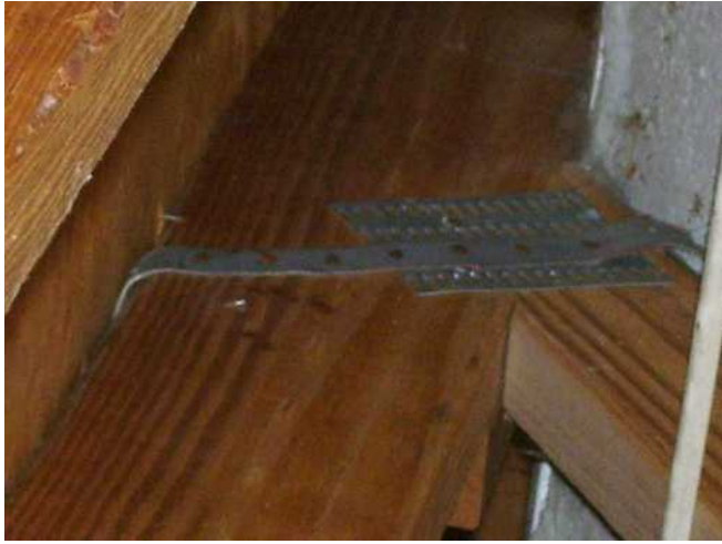
ROOF TO WALL ATTACHMENT – Properly installed Single Wraps

R3 Inspections, LLC P.O. Box 152205 Cape Coral, FL 33915 Office: 239.810.7793 Email: radjrsas@yahoo.com