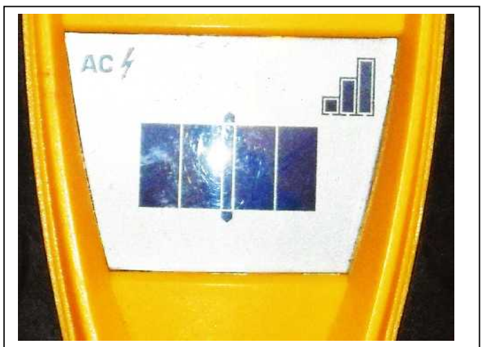
REINFORCED MASONRY EXTERIOR WALL CONSTRUCTION

Terrace II at Heritage Cove Association 14111 Brant Point Circle, Fort Myers, FL 33919 01-12-2012