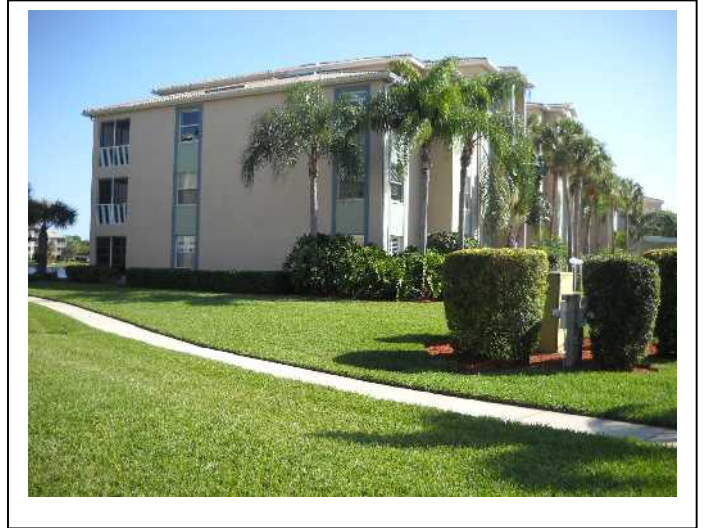
SIDE ELEVATION VIEW