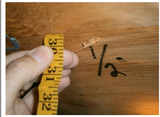
ROOF DECK THICKNESS – ½ inch plywood

R3 of Florida, LLC P.O. Box 152205 Cape Coral, FL 33915 Office: 239.810.7793 Email: radjrsas@yahoo.com