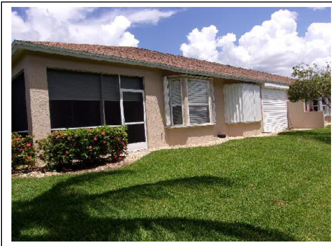
REAR ELEVATION VIEW