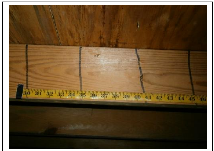
ROOF DECK ATTACHMENT – 8d nails within 6 inches in the field

The Villas I at Heritage Cove Association, Inc. 14189, 14195, 14201, 14207, 14213 & 14219 Mystic Seaport Way, Fort Myers, FL 33919 07-05-2017