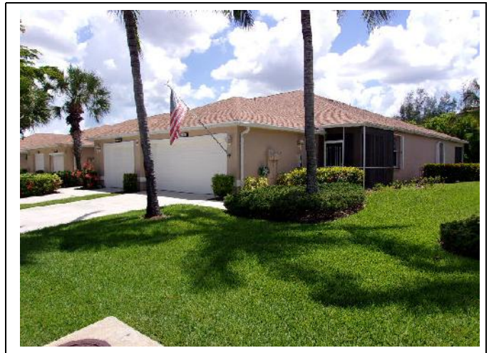
SIDE ELEVATION VIEW

The Villas I at Heritage Cove Association, Inc. 14189, 14195, 14201, 14207, 14213 & 14219 Mystic Seaport Way, Fort Myers, FL 33919 07-05-2017