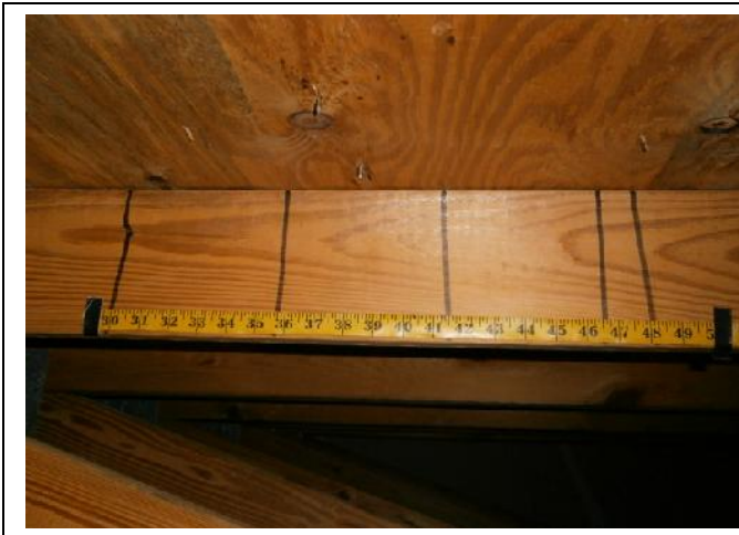
ROOF DECK ATTACHMENT – 8d nails within 6 inches along the edge