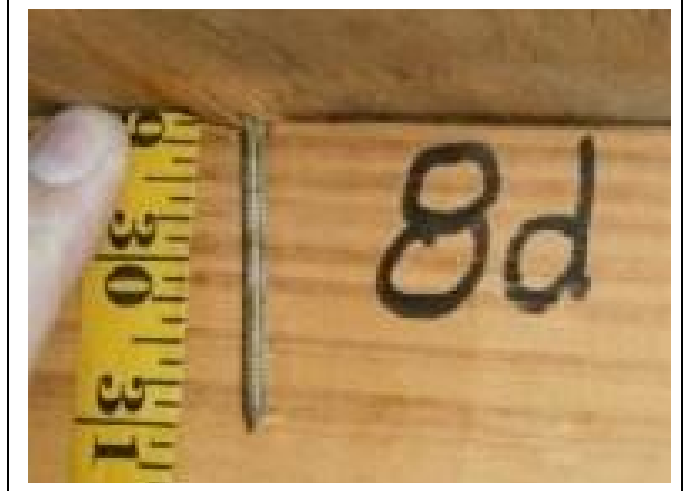
ROOF DECK ATTACHMENT – 8d ring shank nails added in 2016