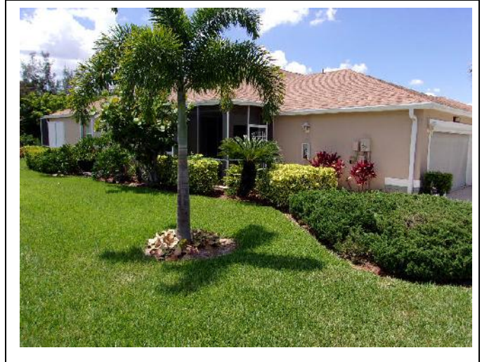
SIDE ELEVATION VIEW