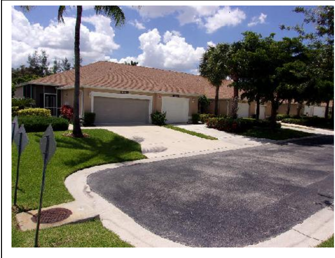
FRONT ELEVATION VIEW

R3 of Florida, LLC P.O. Box 152205 Cape Coral, FL 33915 Office: 239.810.7793 Email: radjsas@yahoo.com