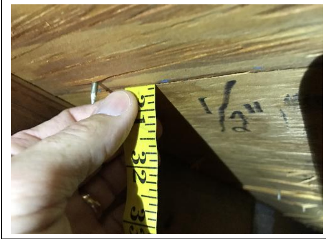
ROOF DECK THICKNESS – ½ inch plywood

R3 of Florida, LLC P.O. Box 152205 Cape Coral, FL 33915 Office: 239.810.7793 Email: radjrsas@yahoo.com