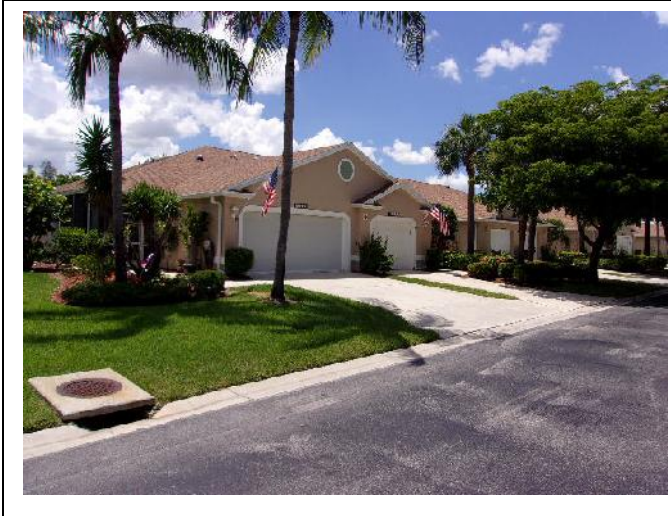
FRONT ELEVATION VIEW

R3 of Florida, LLC P.O. Box 152205 Cape Coral, FL 33915 Office: 239.810.7793 Email: radjrsas@yahoo.com