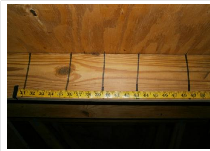
ROOF DECK ATTACHMENT – 8d nails within 6 inches along the edge