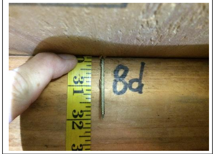
ROOF DECK ATTACHMENT – 8d ring shank nails added in 2016