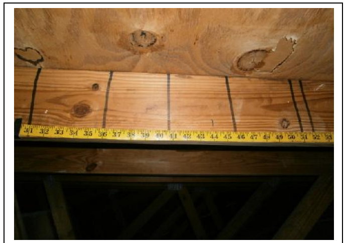
ROOF DECK ATTACHMENT – 8d nails within 6 inches in the field

The Villas I at Heritage Cove Association, Inc. 14153, 14159, 14165, 14171, 14177 & 14183 Mystic Seaport Way, Fort Myers, FL 33919 07-05-2017