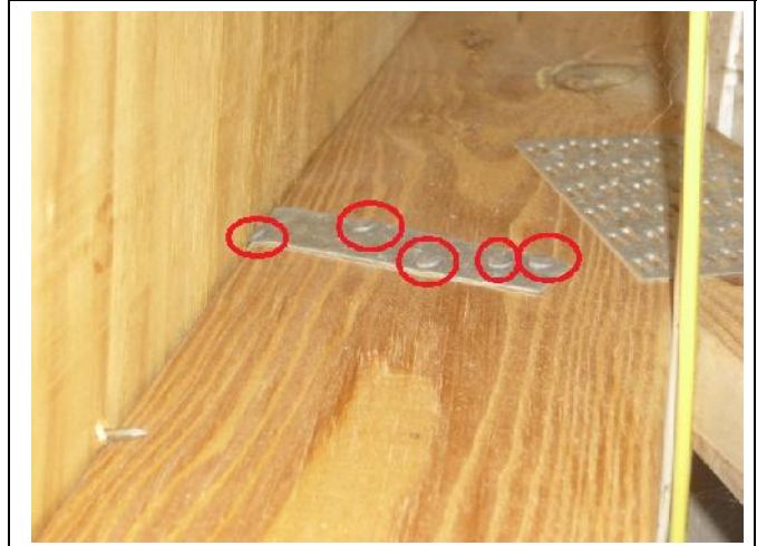
ROOF TO WALL ATTACHMENT – Properly installed Single Wraps