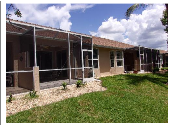
REAR ELEVATION VIEW