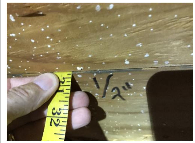
ROOF DECK THICKNESS – ½ inch plywood

R3 of Florida, LLC P.O. Box 152205 Cape Coral, FL 33915 Office: 239.810.7793 Email: radjrsas@yahoo.com