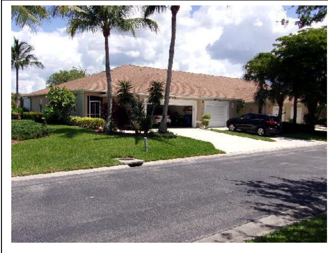
FRONT ELEVATION VIEW

R3 of Florida, LLC P.O. Box 152205 Cape Coral, FL 33915 Office: 239.810.7793 Email: radjrsas@yahoo.com