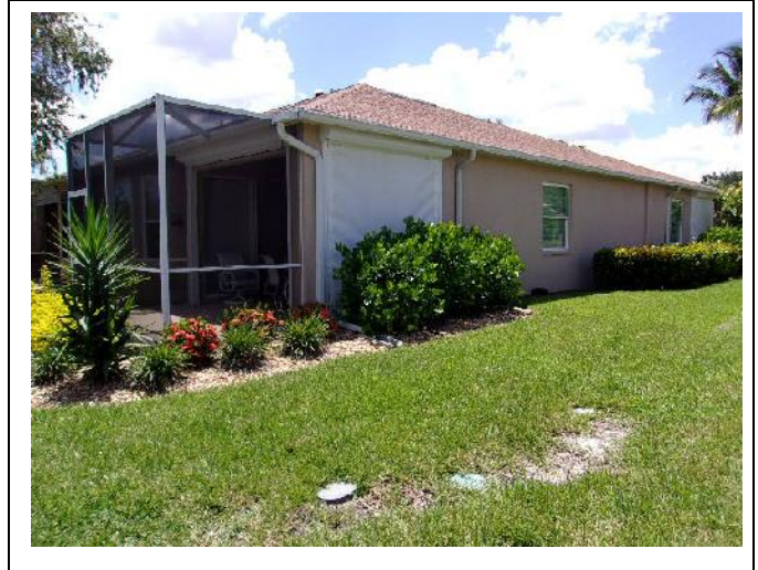
SIDE ELEVATION VIEW