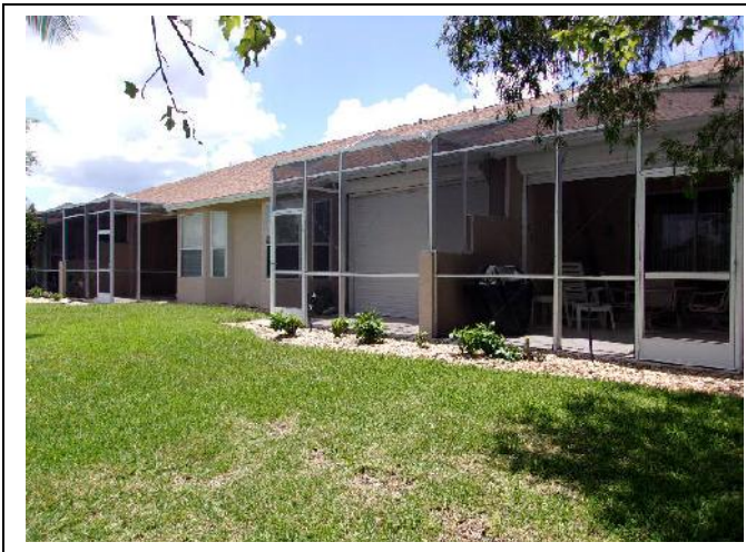
REAR ELEVATION VIEW