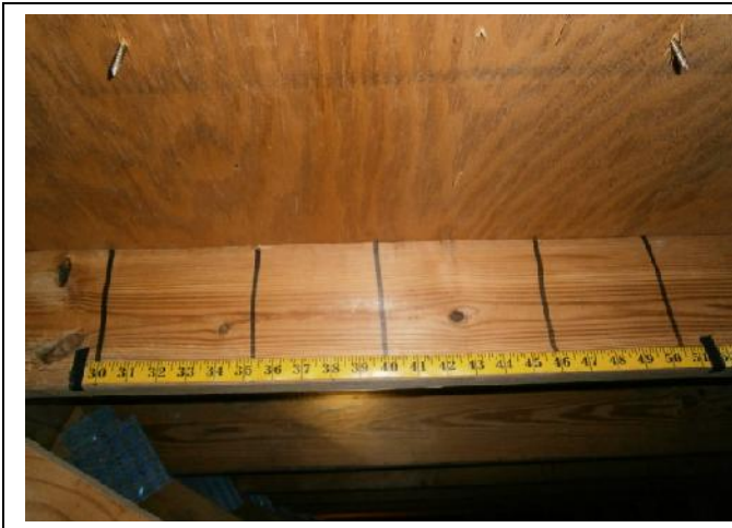
ROOF DECK ATTACHMENT – 8d nails within 6 inches along the edge