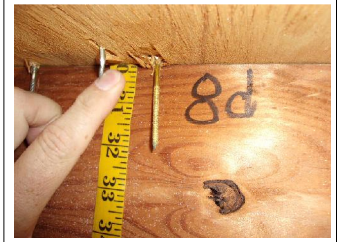
ROOF DECK ATTACHMENT – 8d ring shank nails added in 2016