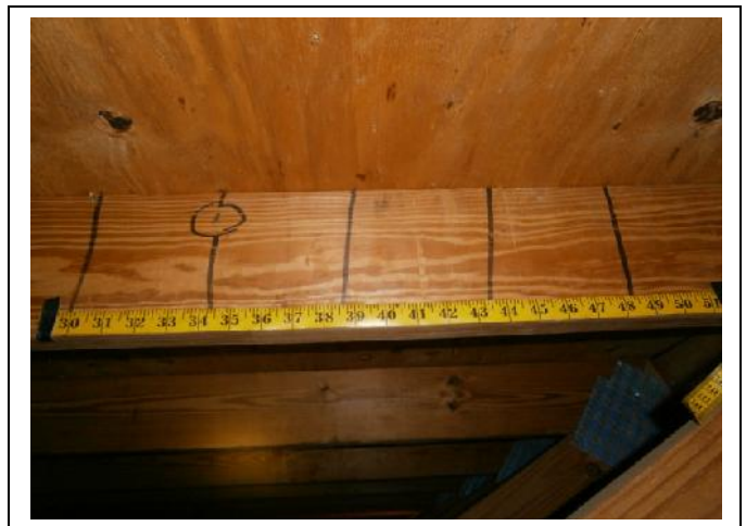
ROOF DECK ATTACHMENT – 8d nails within 6 inches in the field

The Villas I at Heritage Cove Association, Inc. 14120, 14126, 14132, 14138, 14144 & 14150 Brenton Reef Way, Fort Myers, FL 33919 07-05-2017