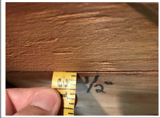
ROOF DECK THICKNESS – ½ inch plywood

R3 of Florida, LLC P.O. Box 152205 Cape Coral, FL 33915 Office: 239.810.7793 Email: radjrsas@yahoo.com