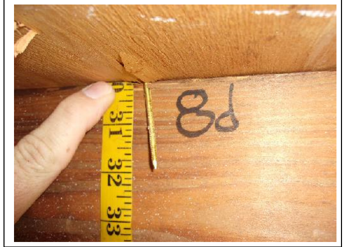
ROOF DECK ATTACHMENT – 8d ring shank nails added in 2016